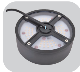
Frosted PC diffuser