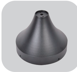
Die casting reflector