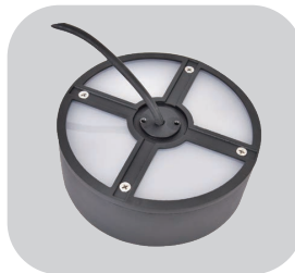
Opal PC diffuser