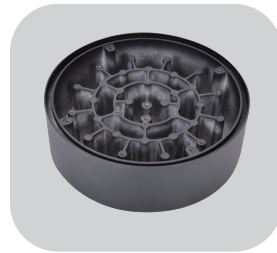
Die casting heatsink